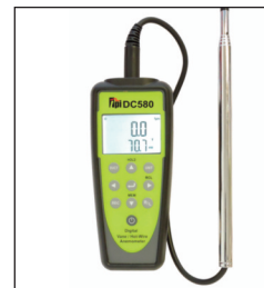
DC580 with hot-wire probe