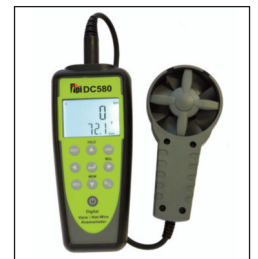
DC580 with vane probe