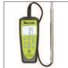
DC580 with hot-wire probe