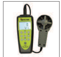
DC580 with vane probe