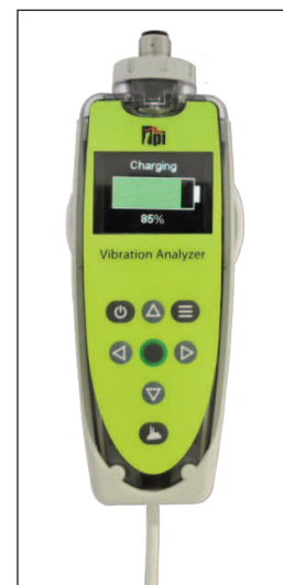
9084 on charger

Supplied in Soft Carry Case with space for 9084, charger, cord, Accelerometer Cable & Accelerometer, Docking Cradle & USB Cable