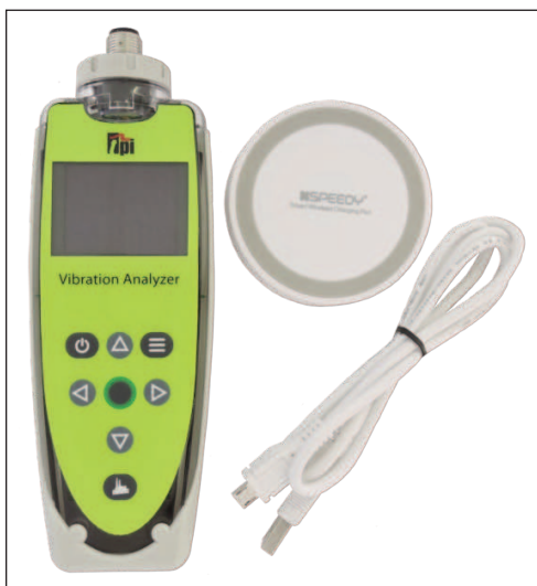
9084 with charger and cord